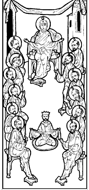
Pentecost: Flames of God's presence and power - God's Spirit - alight on the heads of the Apostles, as they gather around the Mother of God in prayer (see Acts 1.14 & 2.1-4), and fill them with the life of the Holy Trinity. The Apostles surround 'King Cosmos', the world created by God but until now living outside God's Kingdom.

<u>St Martin's</u> The Parish Council decided that we cannot make any higher offer than we have made, but will leave the matter open until 31 Aug, in case the Churches Conservation Trust decide to reconsider - which isn't likely.