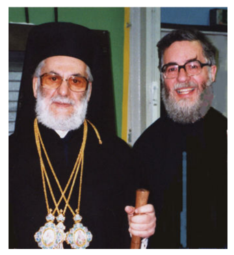
HB Patriarch Ignatius IV of Antioch

at St George's Cathedral in London in 1997